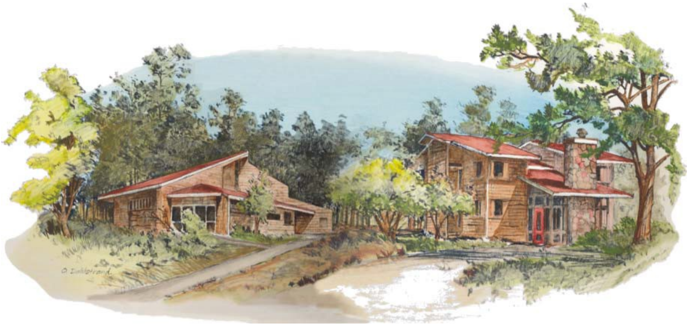
William Penn Mott Jr. Training Center